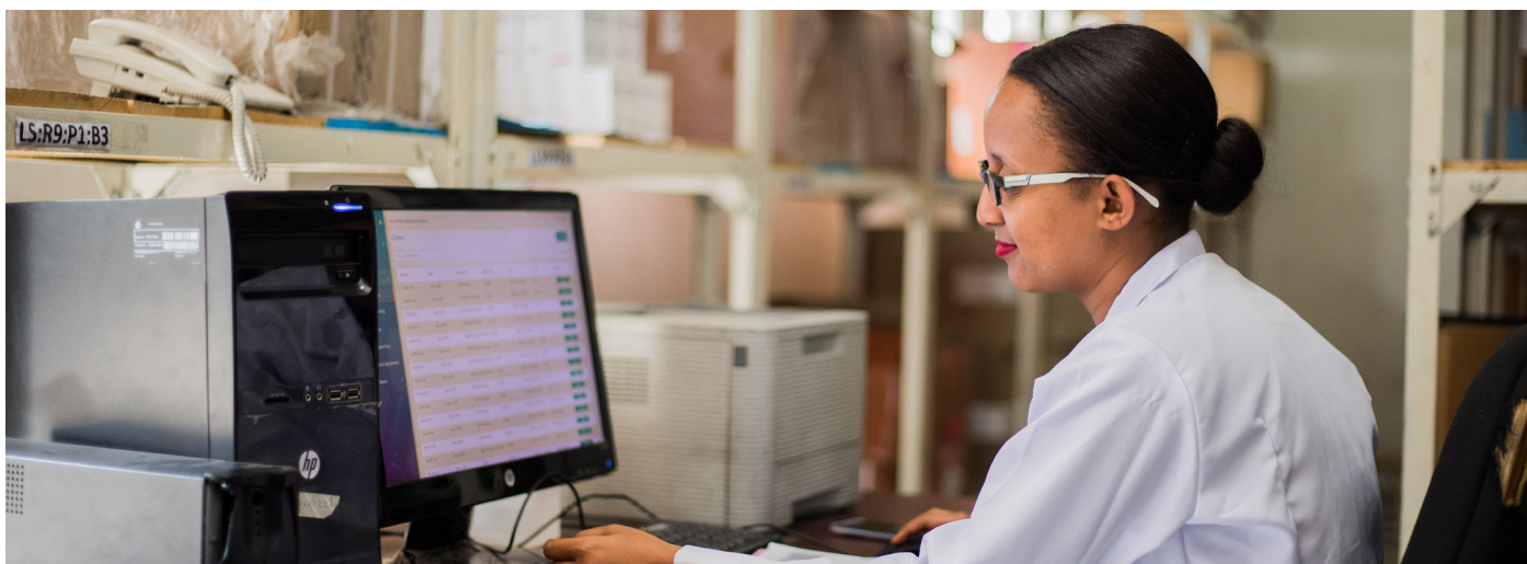
Photo Caption: A DHA-trained pharmacist fills out orders using Dagu 2.0, a software for inventory control. Tikur Anbessa Specialized Hospital, Addis Ababa, January 2020.

The Digital Health Activity (DHA) works with the Government of Ethiopia (GOE) to build sustainable, resilient, and interoperable health information systems (HIS) that ensure the entire health sector has the data, analytics, and skills necessary to improve the health and well-being of all Ethiopians. Together with the GOE and other partners, the DHA is helping the country