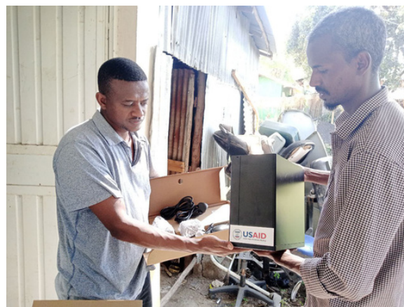
Afrotopia Destination Management Pvt. Ltd. distributes equipment at Ataye Hospital in Amhara.