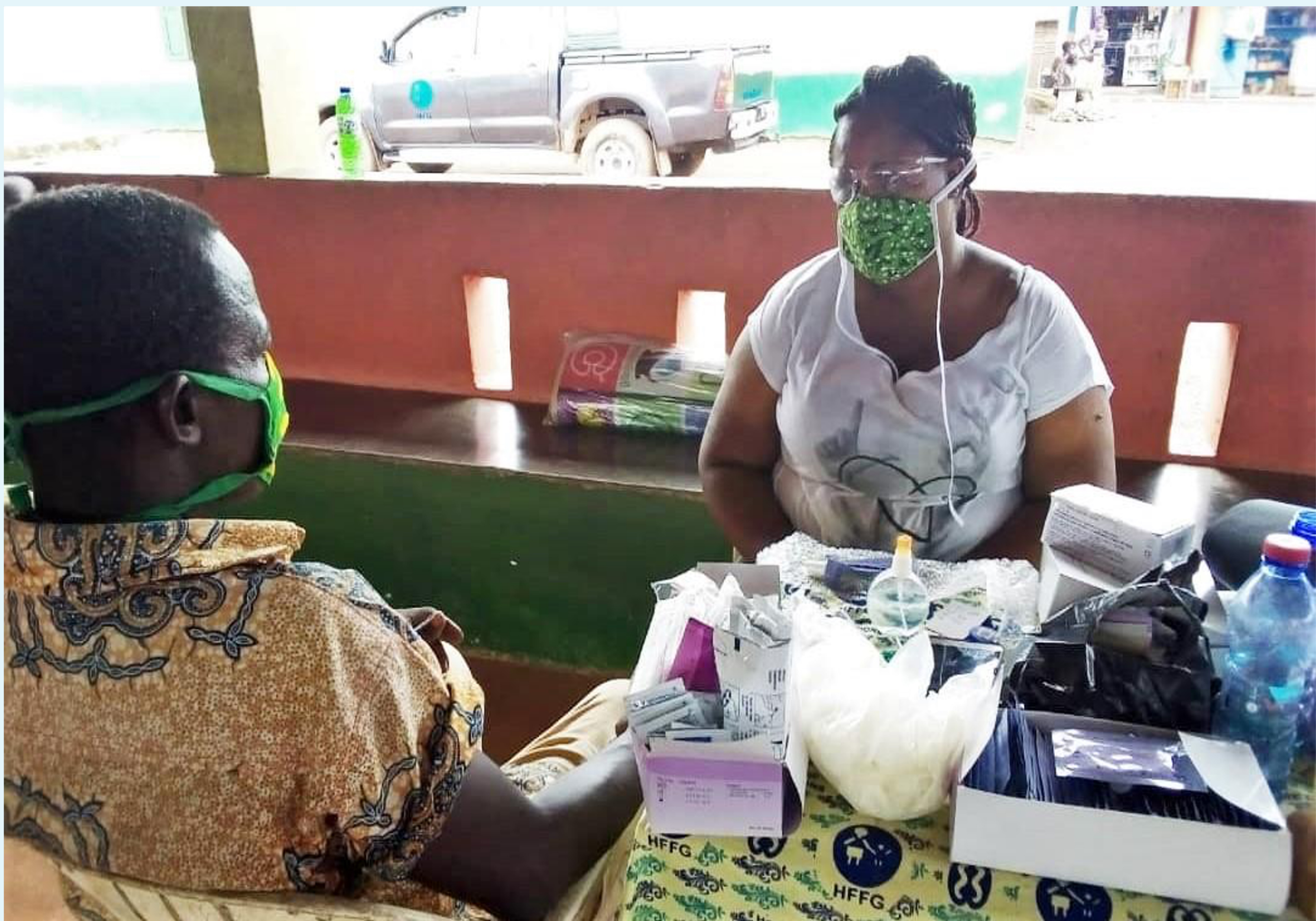
Health care worker providing HIV counseling.

Community-based PrEP distribution is effective and should complement facility-based initiatives. Results of this case study have intrinsic benefits for the review of national PrEP policy.