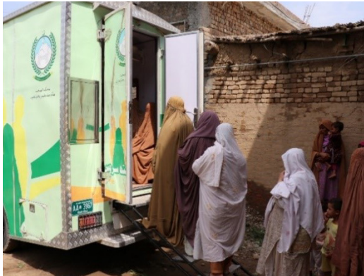
COVID-19 vaccination at MHSU at Toot Kallay, Charsadda, on August 31, 2021