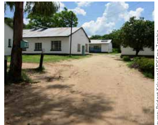
Sichili Mission Hospital.