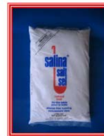
Control of Iodine Deficiency Disorders