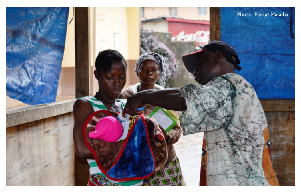
A baby's temperature is checked.

Of the 58 people who contracted the Ebola virus in Dwarzark and its neighboring community, only 14 survived.