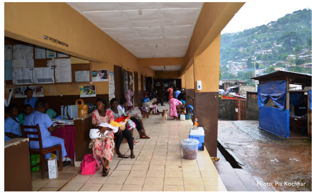
New and expectant mothers wait to see nurses.